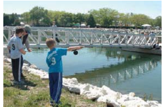
Children learning to fly fish on Lakeshore State Park.

Don't be surprised if you catch a few crappies, sunfish or even tangle with a big northern pike this summer. Walleye also haunt the depths of the estuary. Savvy anglers waiting for nightfall often catch "old marble eyes" as they move shallow to feed under the cover of darkness. Catching a trophy walleye in the glow of the downtown lights is a thing to cherish.