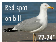
Ring Billed Gull